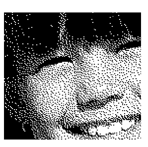
Figure 1. AM screening